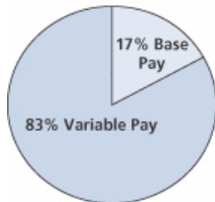
Total Direct Compensation of Chief Executive Officer