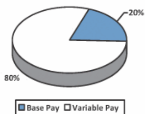
Total Direct Compensation of CEO