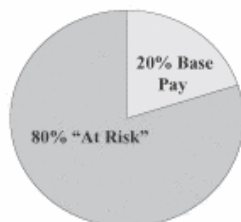
COMPENSATION OF CHIEF EXECUTIVE OFFICER